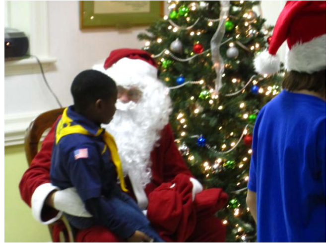
Santa's visit to Cub Pack