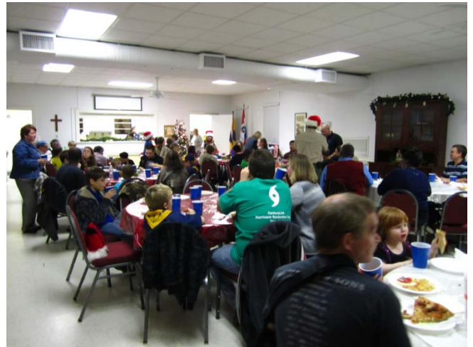
Cub Pack & American Heritage Girls Christmas Party