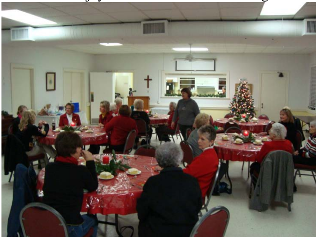
PW enjoy annual Christmas Gathering