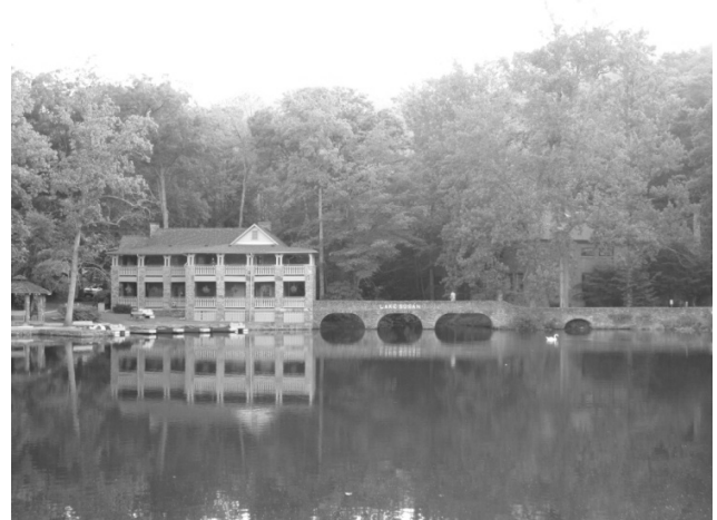
The Left Bank from the dam that makes Lake Susan