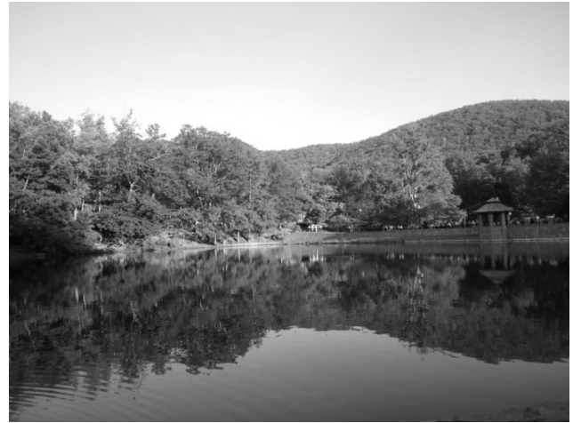
Lake Susan from Assembly Inn